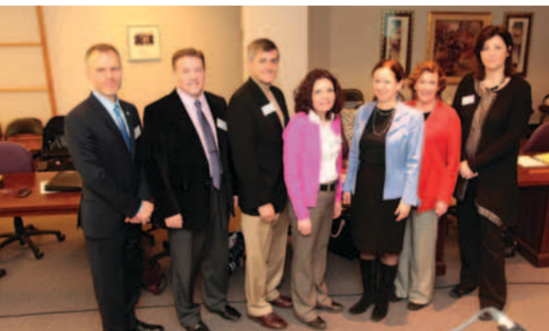
Regulatory Member Panel, January 2013