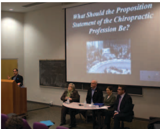
Panel Presentation to CMCC Students – December 2012

The students were enthusiastic about hearing first-hand from leaders in the profession so the panel was re-convened to answer questions in February 2013.