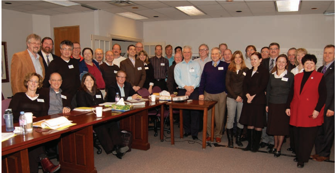
CCO Peer and Practice Assessor Workshop, January 28, 2012

A day of listening, participating and learning