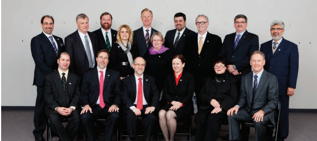
CCO Council at its February 14, 2012 Meeting