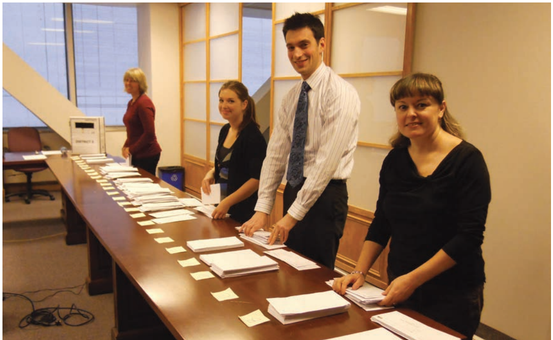
CCO Staff on Election Day, March 28, 2012

A day of listening, participating and learning