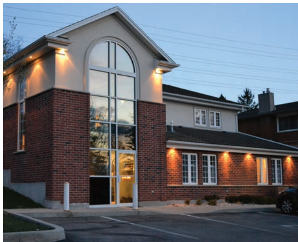
Beechwood Clinic in Waterloo